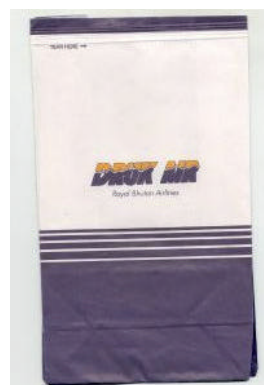
A Druk Air air sickness bag – well worth collecting?

There is apparently quite a market for these items, know among collectors as 'barf bags', and rarer examples such as those of Druk Air can fetch large sums of money.