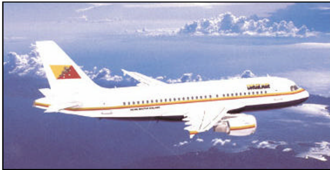
The Airbus A319

D ruk Air will replace its present fleet of two BAe 146 aircraft with two larger jets, the Airbus A319, next year. The decision was made by the Council of Ministers after an appraisal report by Druk Air, demonstration flights and discussions with several aircraft manufacturers.