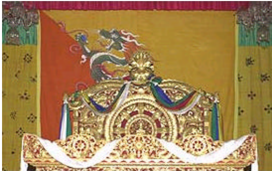
The flag behind the throne in the National Assembly Hall is in the style of the first national flag.

The first national flag was created at the initiative of the second king, His Majesty Jigme Wangchuck. It was designed in 1947 by Mayuem Choying Wangmo Dorji, as a national flag was required for Bhutan's attendance at the First Asian Conference in New Delhi (March 23, 1947).